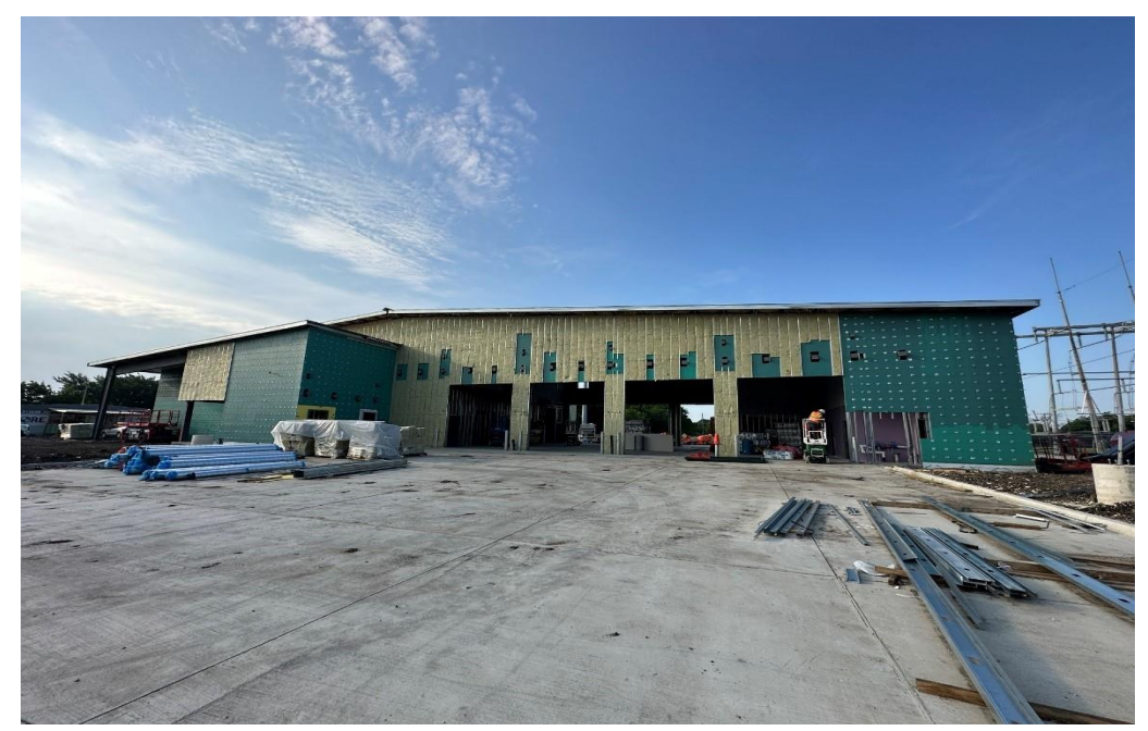
North Elevation Facing Apparatus Bay Entry