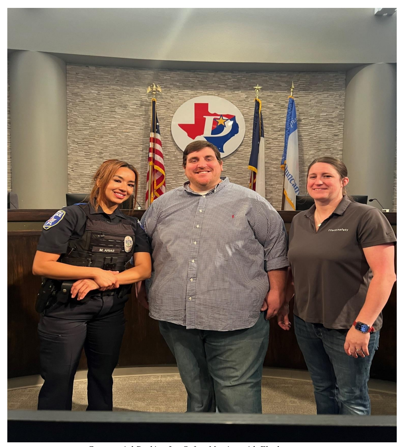
Commercial Parking Lot Safety Meeting with Flock