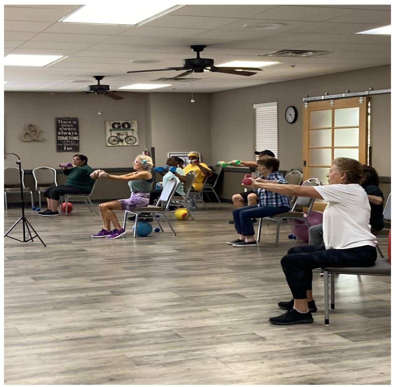
New Class – Sittercise at the D.L. Hopkins Jr. Senior Center