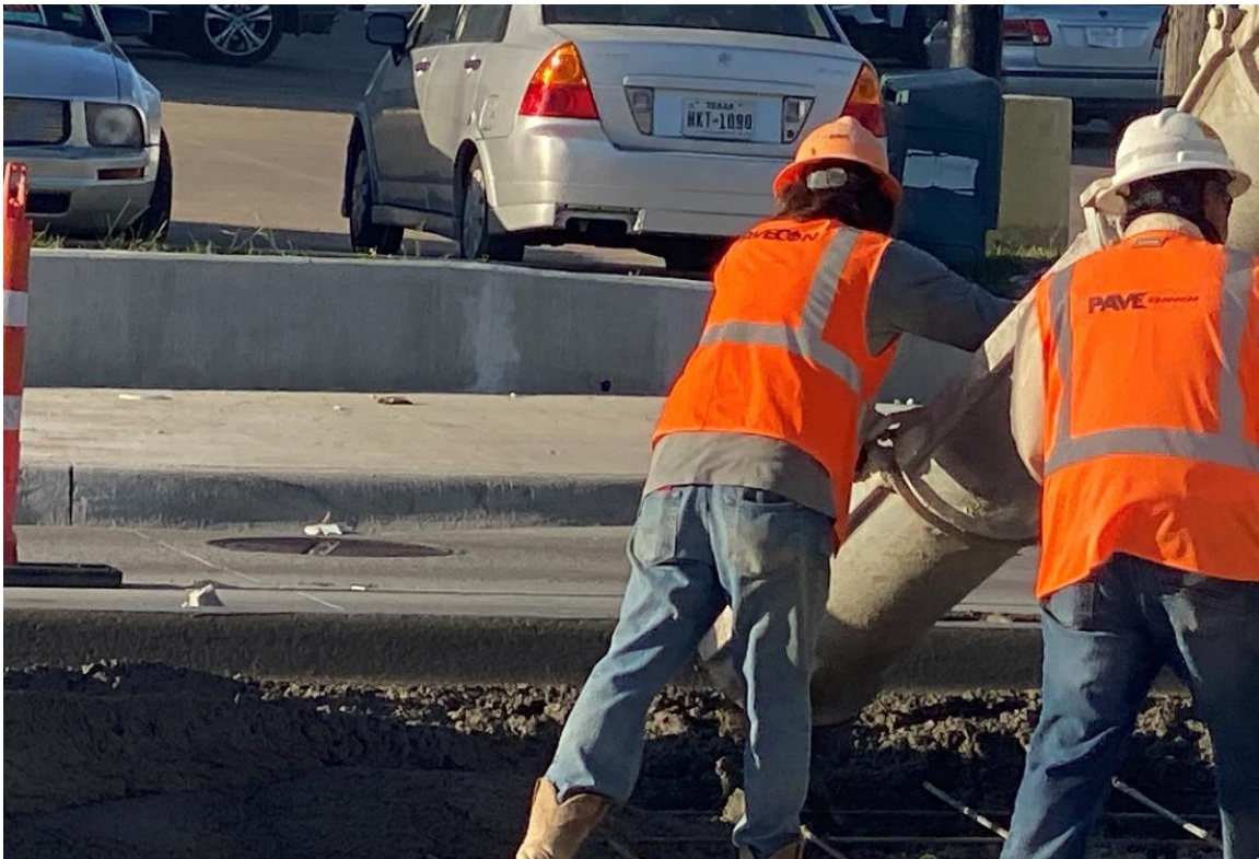
Turn Lane Paving