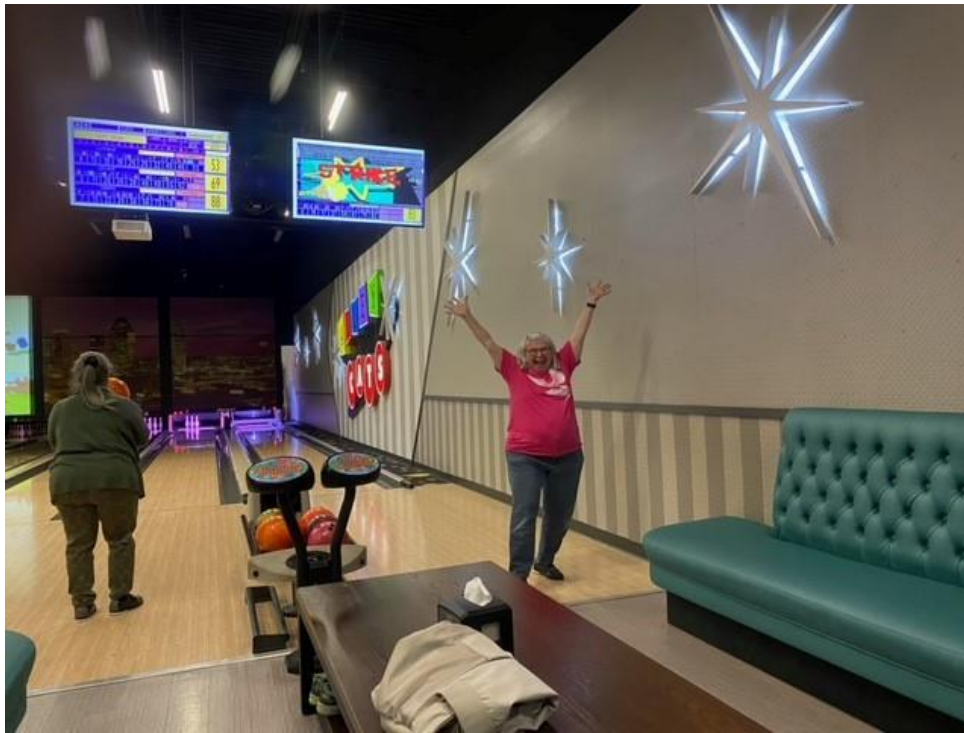
Alley Cats Bowling Trip