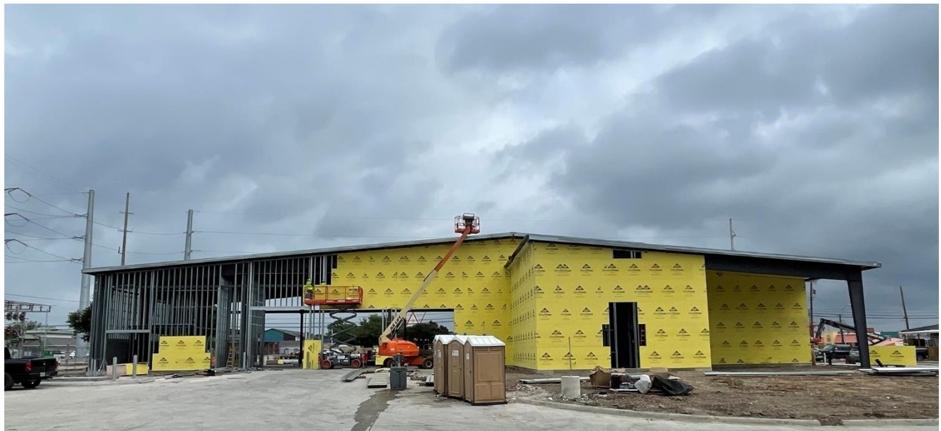
Fire Station 271 – Insulation Install