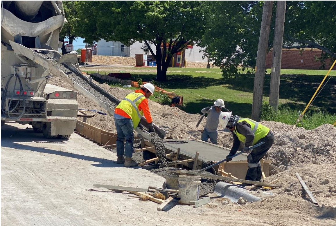
Placing Concrete for Curb Inlet