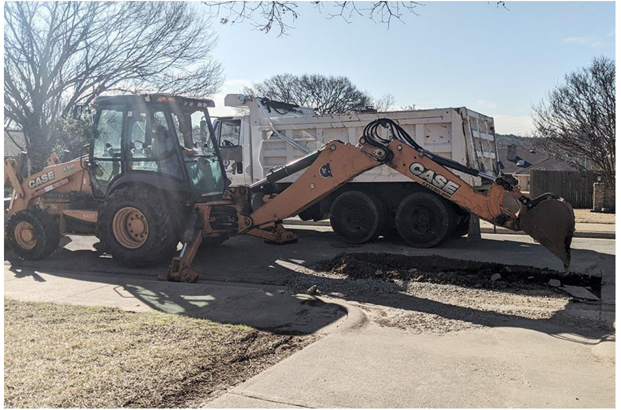
Repairing a utility cut at 701 Athenia Way