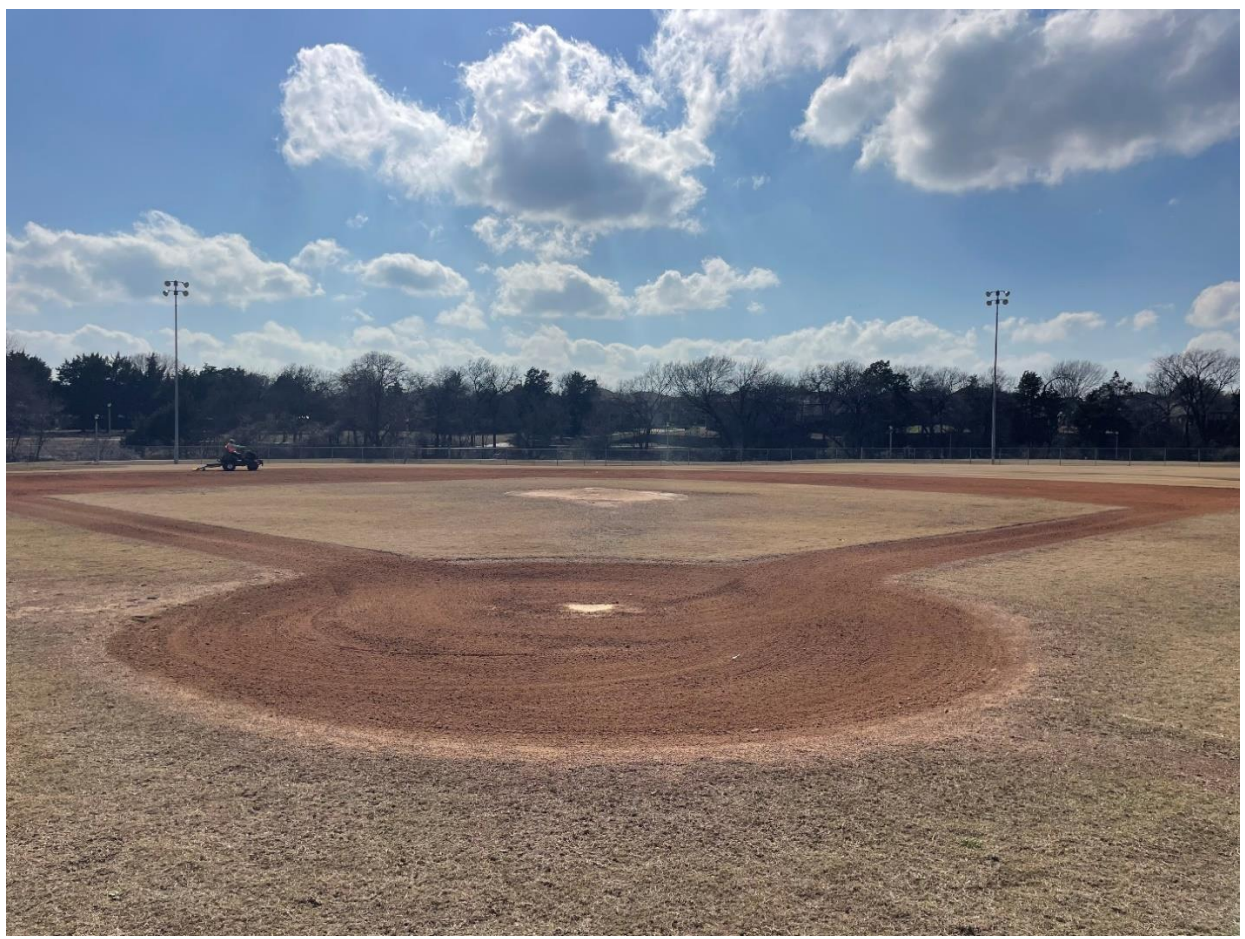
Field maintenance at Harrington Park