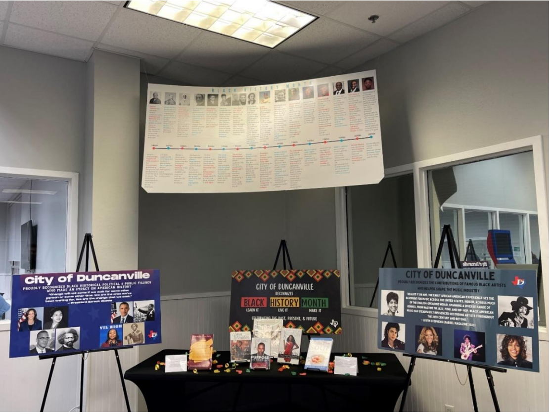
Black History Month display at the Duncanville Recreation Center