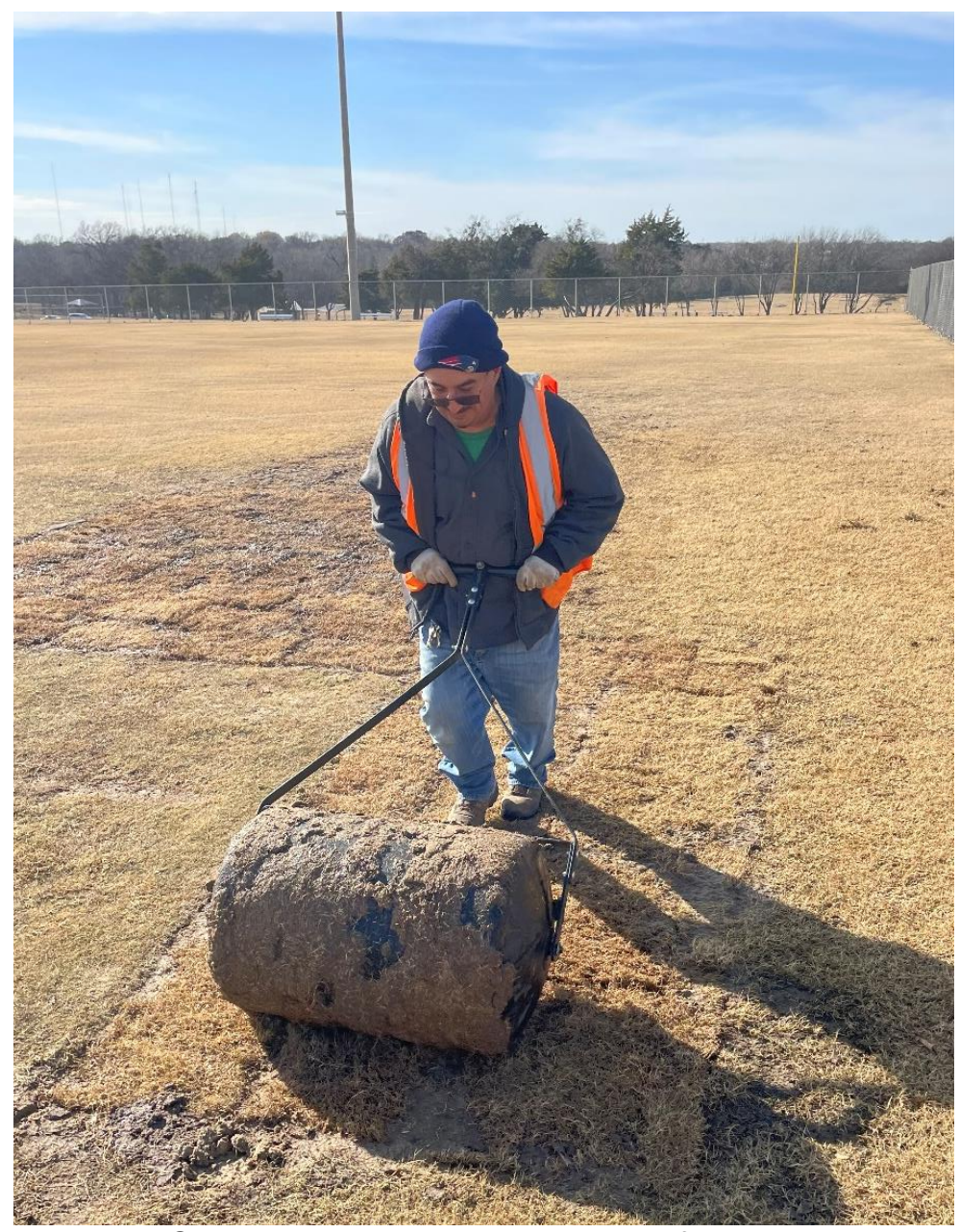
Sod repair at Harrington Park soccer field