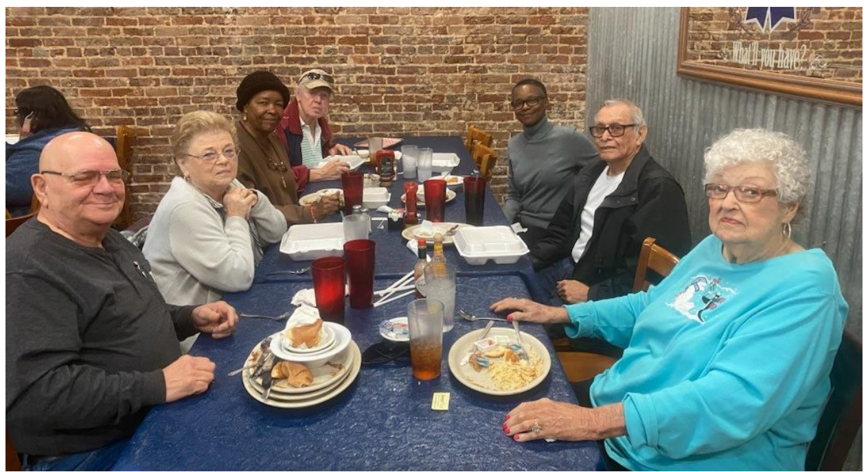
Monthly mystery lunch at Cartwright's Ranch House in Denton, Texas