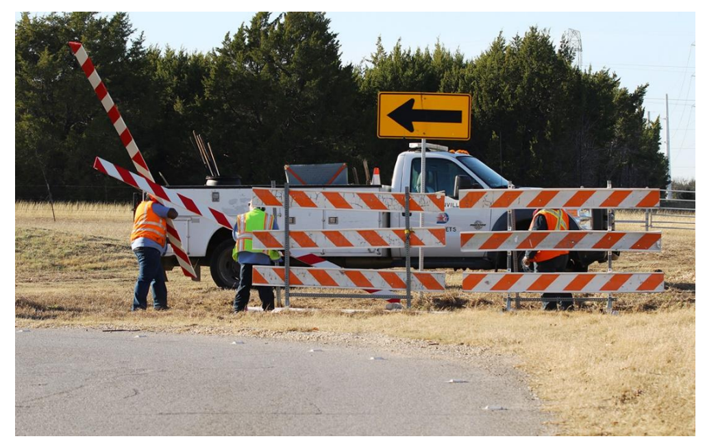
Replacing permanent barricade at Santa Fe and Joe Wilson Rd.