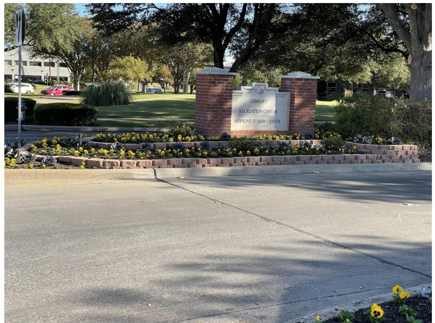
Fall annuals at City Hall and James Collins Blvd.

City of Duncanville • P.O. Box 380280 • Duncanville TX 75138 • (972) 780-5017 • Fax (972) 780-5077