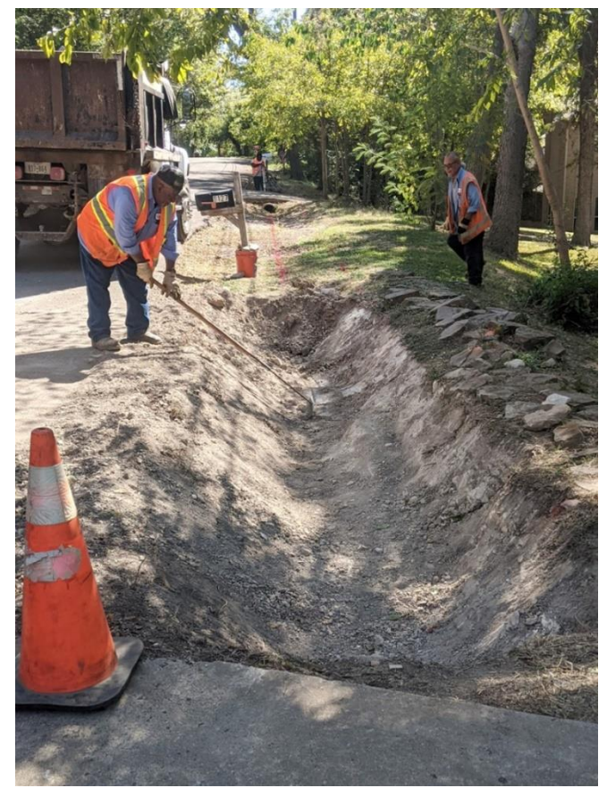
Cleaning bar ditch on Jungle