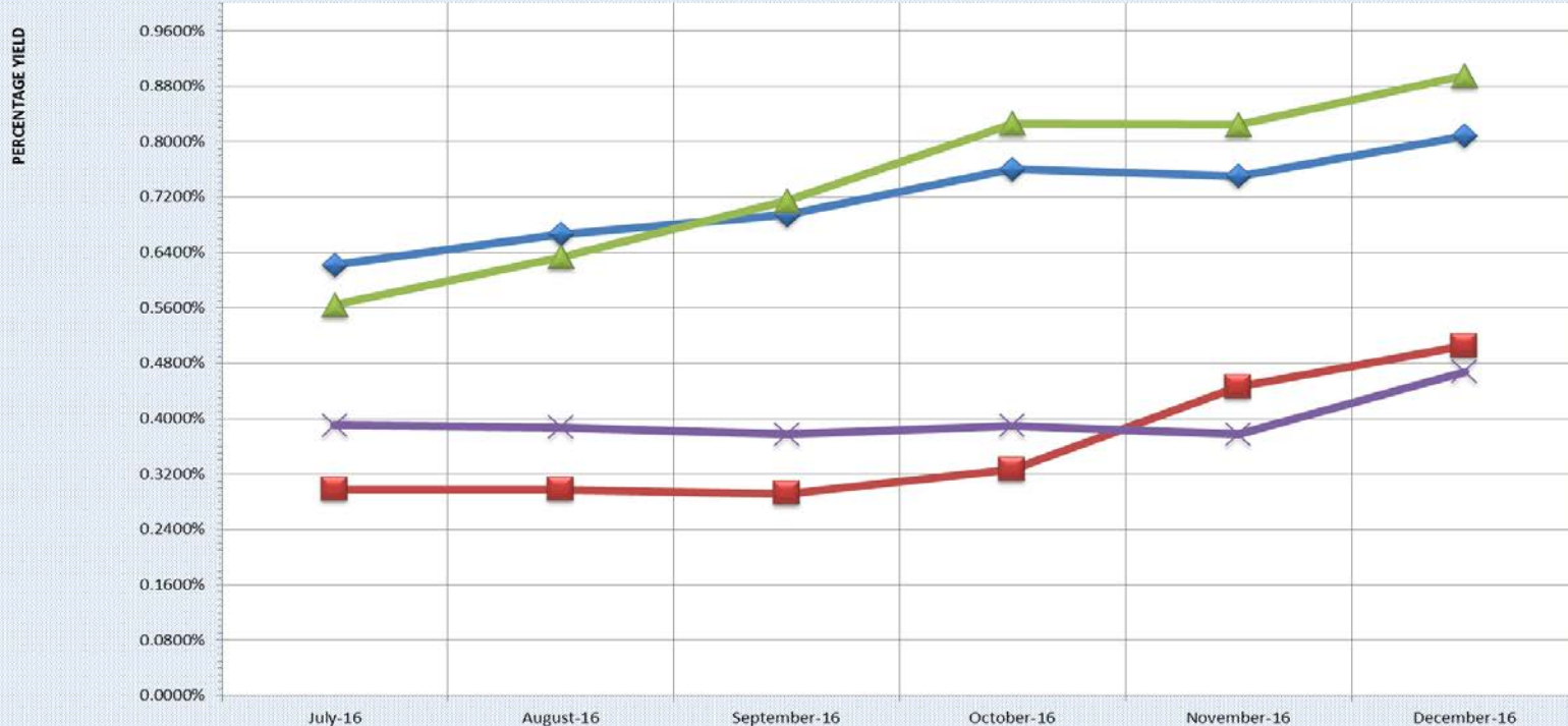
Earnings and Yield Summary Quarter Ended 12/31/16 Plus Prior Quarter Ended 9/30/16