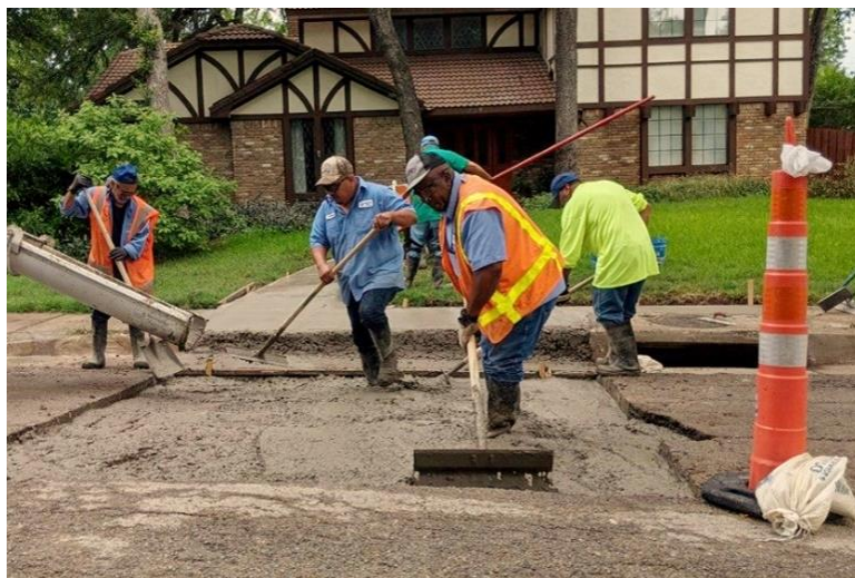
Utility Cut repair at 419 Swan Ridge