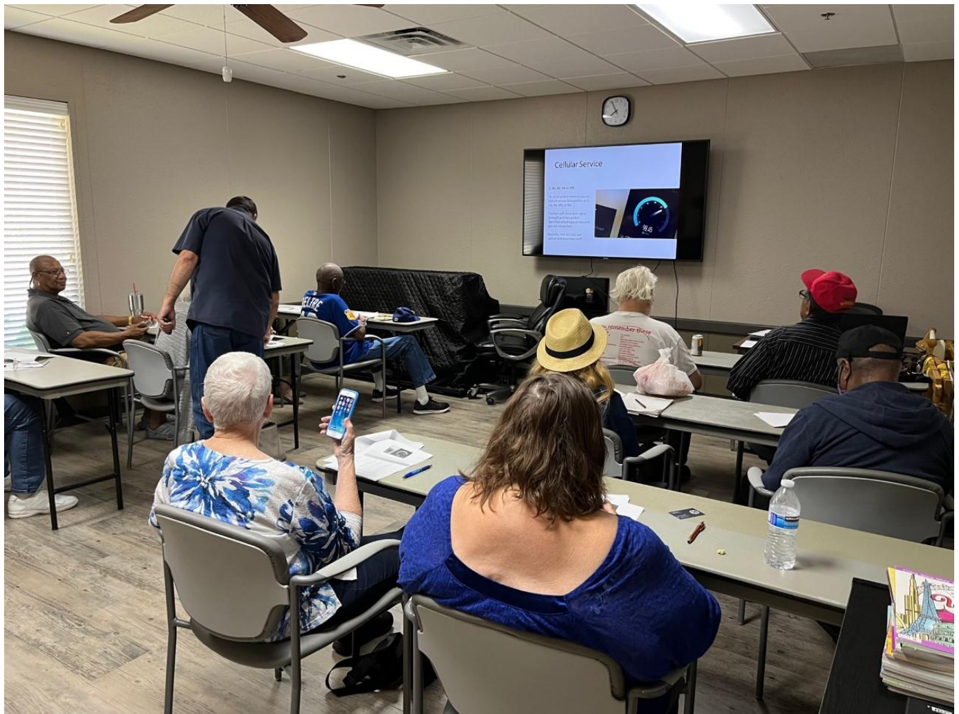
2022-06-13 Smartphone class at D.L. Hopkins Jr. Senior Center